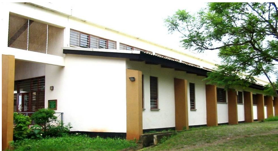
Part of Bunda College Library Building

The Library is composed of the following sections/areas: