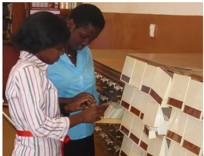
Students Searching for Library materials using a Card Catalogue

From 1990 to 2001 the Library created online databases for its books and pamphlets using a database management system called CDS/ISIS. The databases contain bibliographical details of an item.